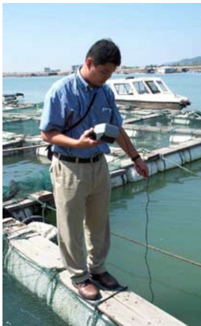
Handheld sampling around small-scale sea cage operation with a YSI 550A.

It must be noted that a well managed farm with good husbandry practices will have a negligible impact on the environment. An efficiently run operation will have several people monitoring and observing various aspects of the operation on a daily basis. With proper monitoring equipment many of these tasks can be continuous and on-going with minimal oversight. Proper feeding amounts can have serious implications, not only financially, but also ecologically on the local environment.