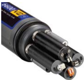
YSI 6600 V2 multiparameter instrument with wiped optical sensors.

Preventing these losses can nearly be eliminated with monitoring systems designed to alert when potential water concerns are present. A complete system setup to perform continuous water quality monitoring along the vertical water column coupled with velocity and directional information will allow for an accurate understanding of conditions inside and around the cages.