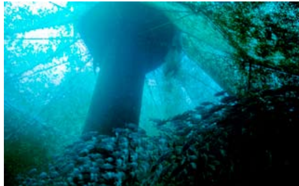
Inside a sea cage off the coast of Hawaii.

A buoyed, or cage mounted, YSI 6600 V2 can be used to vertically profile the water column and send data remotely for parameters such as; dissolved oxygen, pH, ORP, temperature, chlorophyll, turbidity, blue-green algae, salinity and conductivity. The wiped sensor technology helps prevent biofouling on the sensing portion of the probes reducing labor and maintenance costs while providing more accurate data.