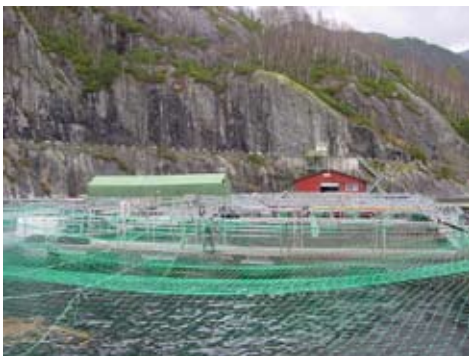
A sea cage operation nestled into a sheltered bay with good water flow.

In South Australia, for instance, the South East region has seen expansion in Atlantic Salmon ( Salmo salar ) farming in recent years and has increased as culture sites become available as a result in changes to the Marine Aquaculture Management Plan for the region. The Southern Bluefin Tuna ( Thunnus accoyii ) industry has grown steadily in terms of both whole weight production and value. Interest in Snapper ( Pagrus auratus ) culture has declined due to slow growth rates and the replacement of the species with two new and possibly more economical species: Yellowtail kingfish ( Seriola lalandi ) and Mulloway ( Argyrosomus hololepidotus ).